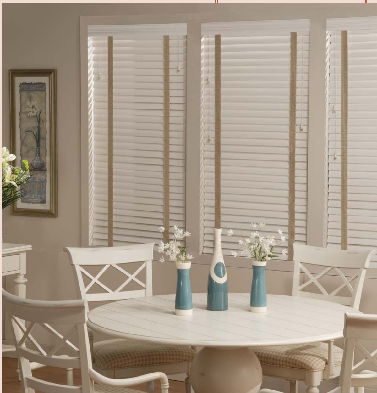
Wood and Faux Wood Reference Guide